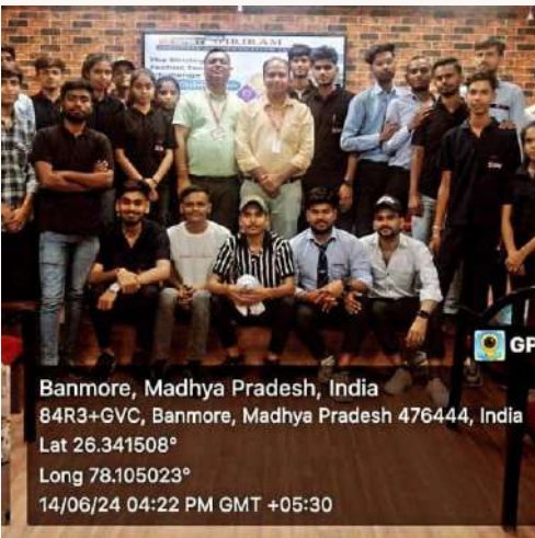
Banmore, Madhya Pradesh, India 84R3+GVC, Banmore, Madhya Pradesh 476444, India Lat 26.341508° Long 78.105023° 14/06/24 04:22 PM GMT +05:30